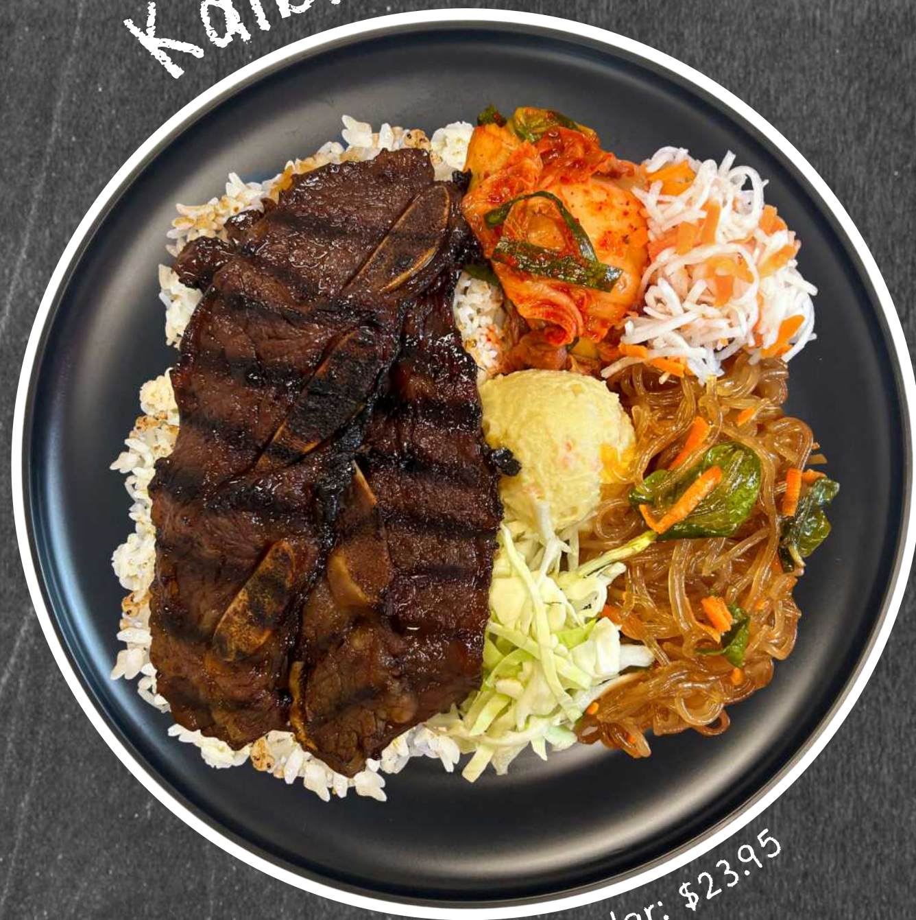
6. Kalbi Plate