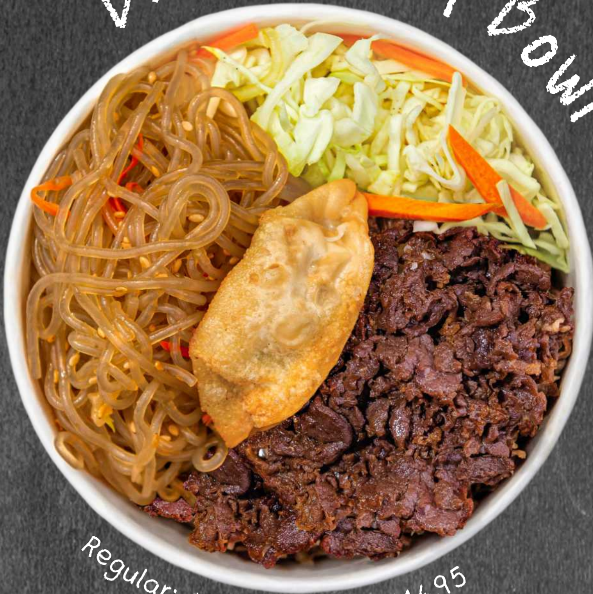
2. Bulgogi Beef Bowl