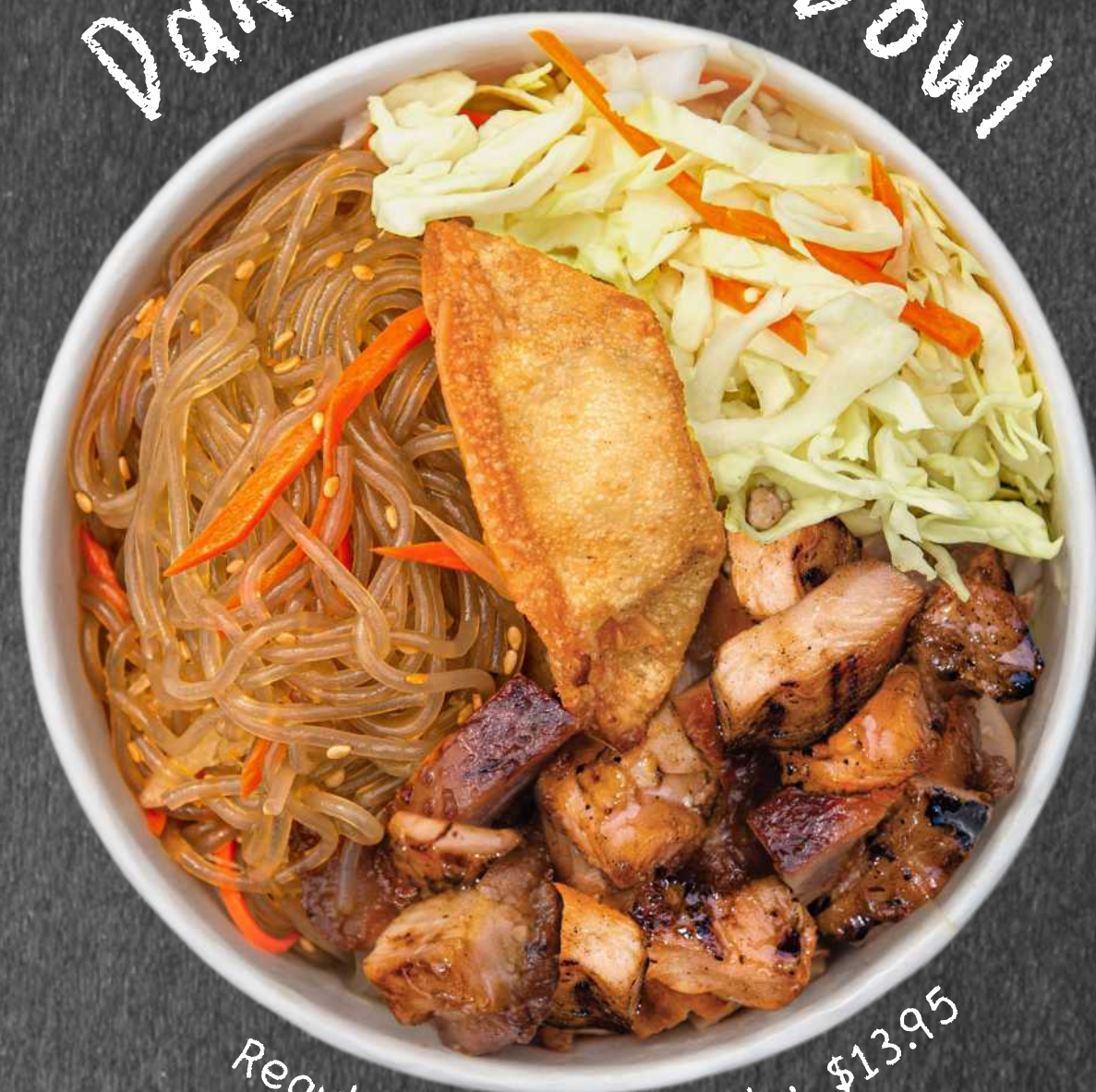
3. Dak Chicken Bowl