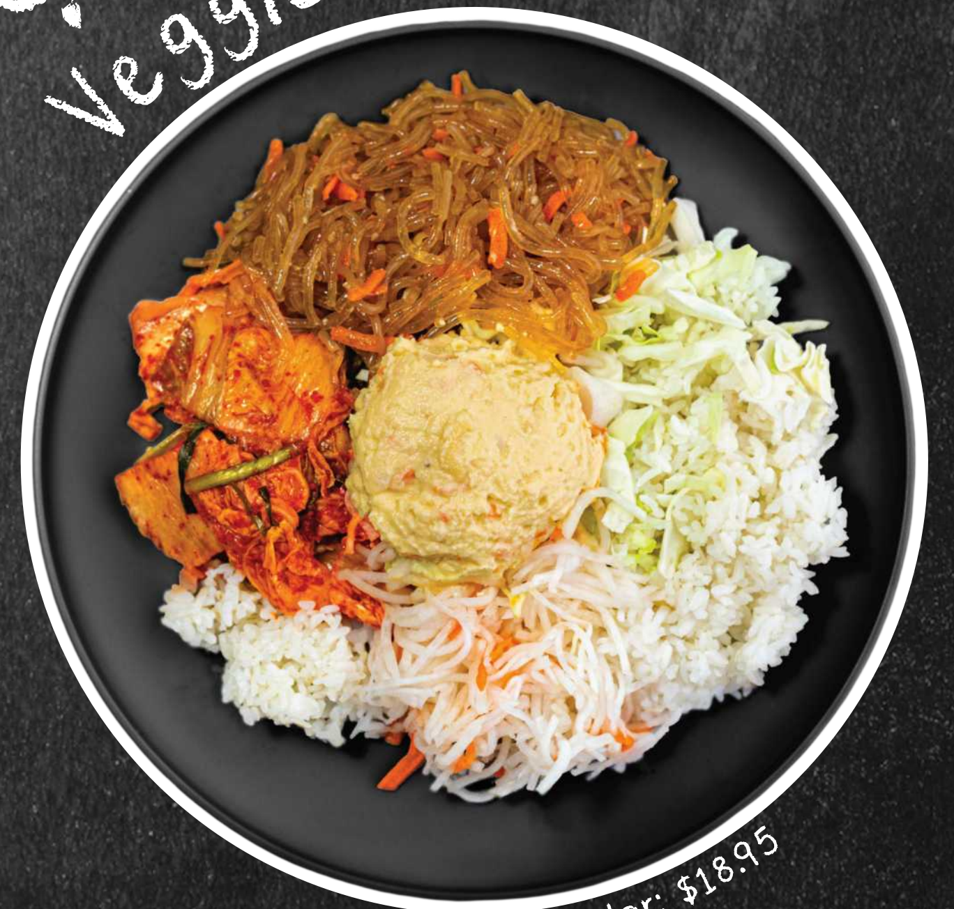
10. Veggie Plate