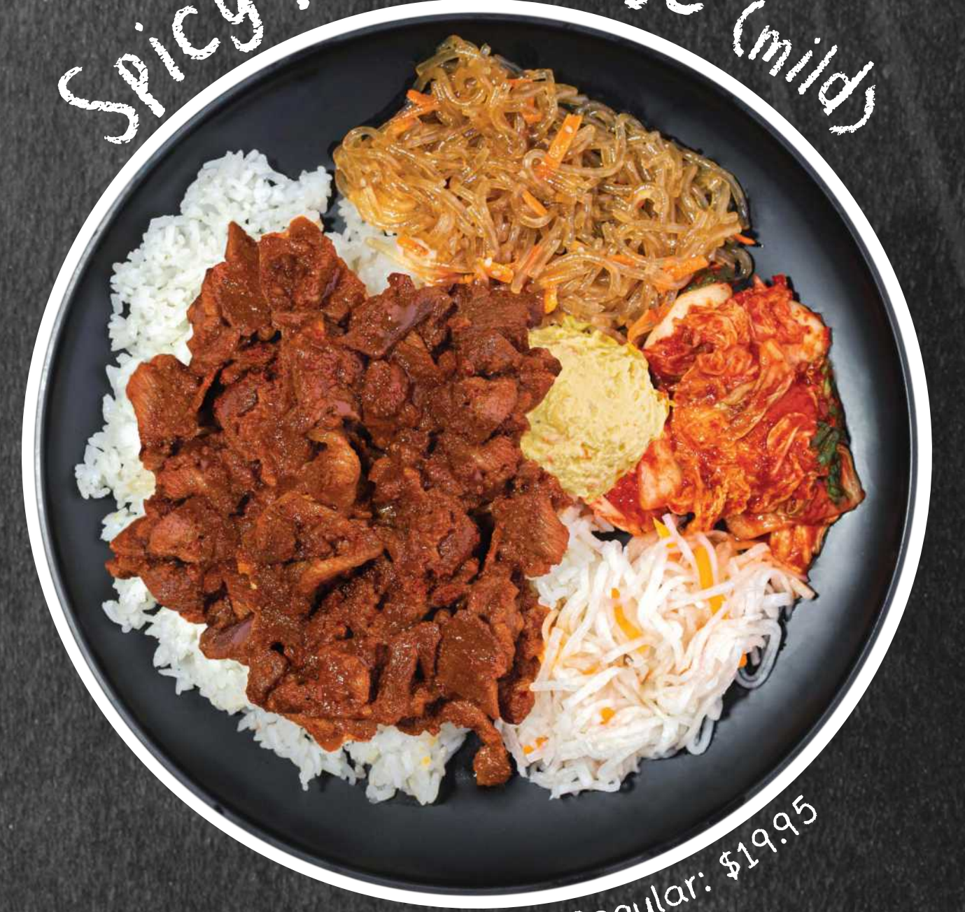
7. Spicy Pork Plate (mild)