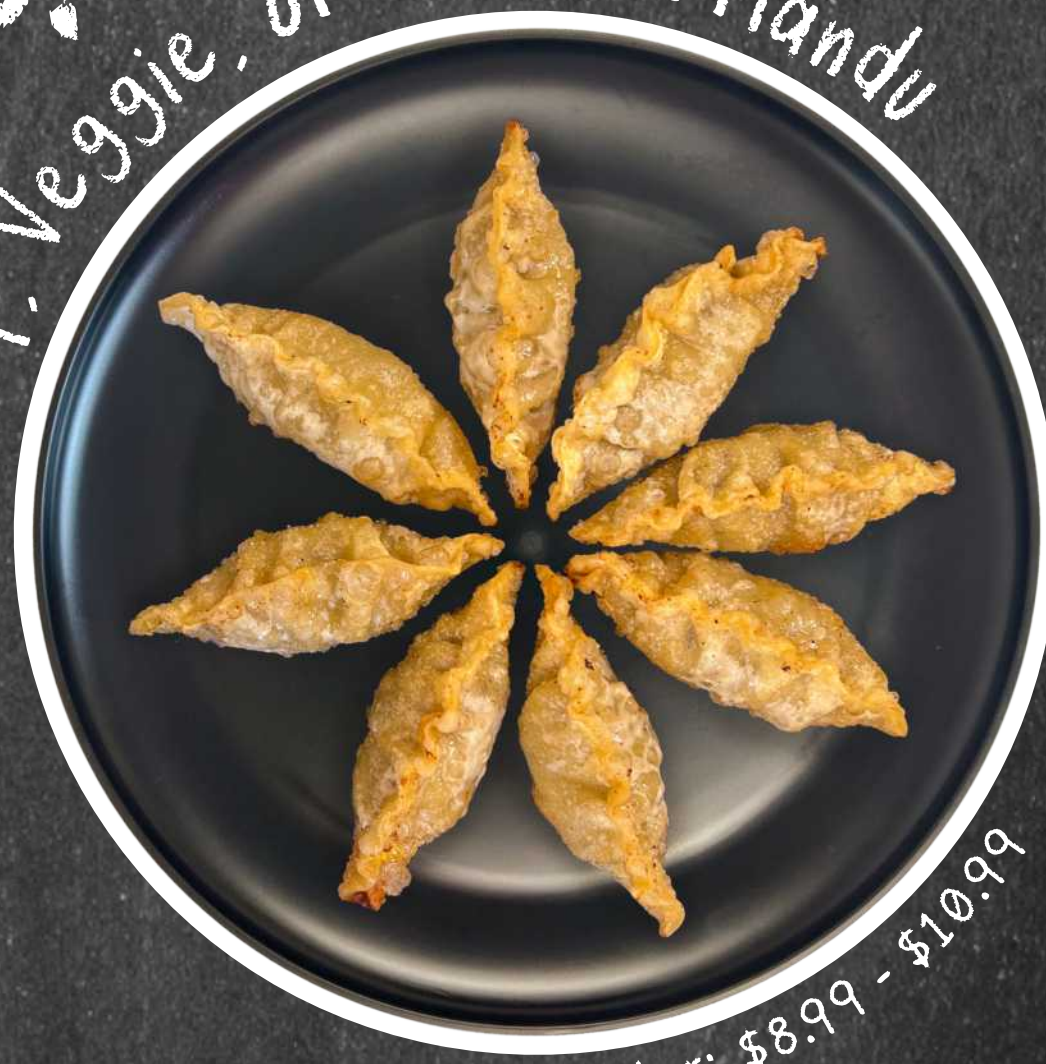
9. Beef, Veggie, or Chicken Mandu