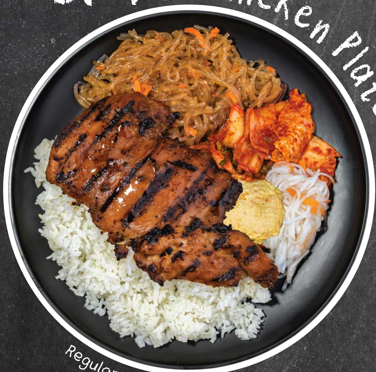
8. Dak Chicken Plate