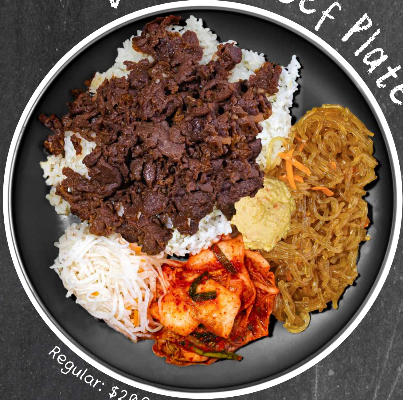
5. Bulgogi Beef Plate

Includes: Rice, Japchae (Sweet Potato Noodles), Potato Salad, Pickled Radish, and Kim Chee (optional)