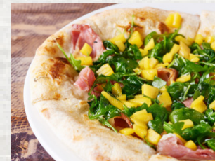
mālaekahana mango MOST POPULAR

When you see this pizza you will say "Holy Cow!". BBQ sauce, mozzarella cheese, pan seared chicken, a load of our world famous french fries, more mozzarella cheese topped with BBQ sauce and ranch dressing. Oh yeah, and candied bacon to top it off!