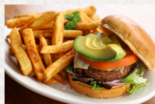
pipeline vege burger