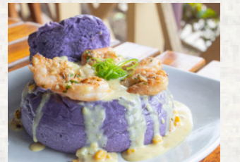
garlic shrimp chowder in taro bowl

Perfect for any surfer or surfer at heart. Fresh corn tortillas, crispy shrimp, red cabbage slaw, and mango papaya salsa, topped with liliko'i cilantro aioli and served with fresh cut limes.