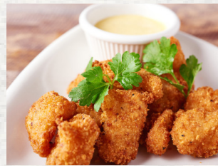
pounders nuggets MOST POPULAR