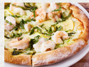
kahuku shrimp pizza

Fresh shrimp flavored with our homemade pesto and zesty lemon slices, basil, and mozzarella cheese.