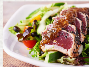
ahi tatakī salad MOST POPULAR

Perfect for any surfer or surfer at heart. Fresh corn tortillas, crispy shrimp, red cabbage slaw, and mango papaya salsa, topped with liliko'i cilantro aioli and served with fresh cut limes.