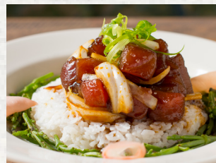
pounders fresh poke

Juicy local kālua pork, served with locally made spinach-flour tortillas, shredded white and yellow cheddar cheeses, and a side of mango-papaya salsa.