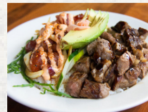
surf & turf bowl MOST POPULAR

5oz ribeye USDA prime-choice grade, grilled and glazed with soy balsamic reduction with 4oz Hawaiian fresh ahi poke & sriracha mayo and togarashi, on a bed of rice and garnished with Kahuku sea asparagus and avocado, Hawaiian sea salt and pickled ginger- Sides sold separately.