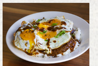
loco moco NEW

Pounders aged 10 oz. rib-eye steak is grilled and paired with marinated fresh Hāmākua mushrooms. Topped with soy balsamic sauce