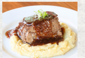
boneless rib w/ kalbi sauce MOST POPULAR

A braised short rib, barbecued for a light searing, glazed in our cast iron pan with our Kalbi sauce.