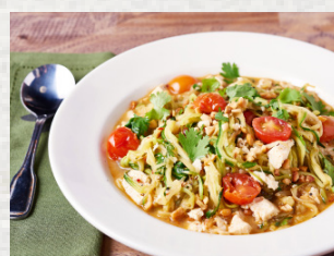
zucchini stir fry noodles

Served with your choice of fries, Pūpūkea side salad, rice or ulu mash. All burgers are 1/2 pound Big Island grass fed beef patties.