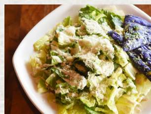
caesar salad with focaccia

Our classic caesar salad comes complete with fresh focaccia bread baked to perfection in our kiawe wood-fired oven with parmesan cheese sprinkled on top.