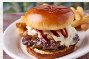
mushroom swiss burger