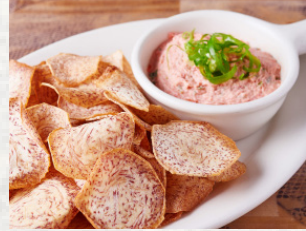
taro chips with smoked a'u dip

Ancient Hawaiians enjoyed raw 'ahi tuna mixed with natural ingredients to enhance its delicate flavor. Tossed with sea asparagus, pickled ginger, spring onions and sea salt.