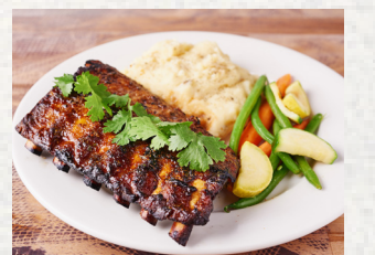
sweet baby back ribs

Half rack of baby back ribs, marinated then braised for a full-flavor effect, then finished with Sweet Baby Ray's BBQ sauce with a pineapple & honey glaze