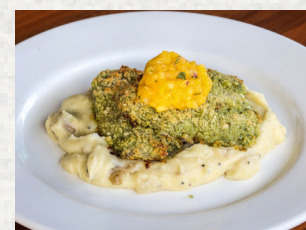
mac nut mahi-mahi

Fresh shrimp with chopped garlic, Hawaiian sea salt, and coconut milk, topped with mango papaya salsa.