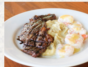
surf and turf

Grilled 5 oz. rib-eye steak and garlic shrimp served surf and turf Pounders Beach style!