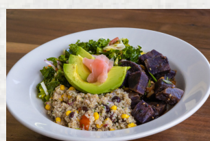
island style sweet poke bowl